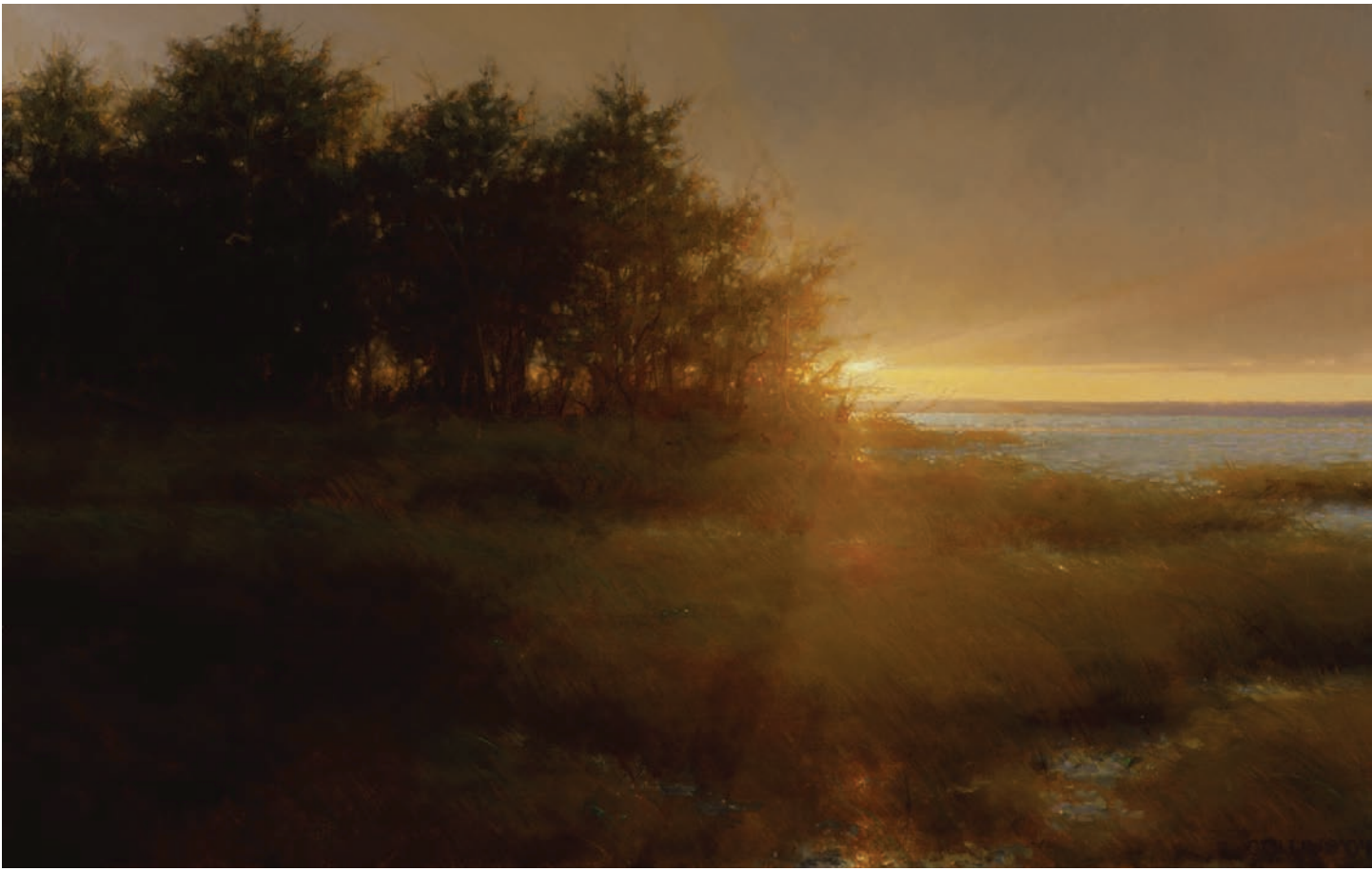
THIS IS A REPRINT OF THE ARTICLE THAT APPEARED IN THE SPRING 2007 ISSUE OF COLUMBIA MAGAZINE .